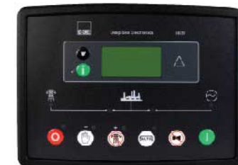
DSE 6020 GENERATOR CONTROLLER