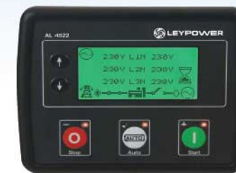
AL 4522 GENERATOR CONTROLLER